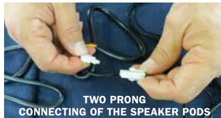
TWO PRONG CONNECTING OF THE SPEAKER PODS