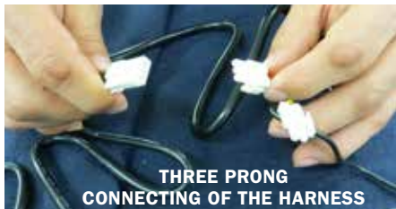
THREE PRONG CONNECTING OF THE HARNESS