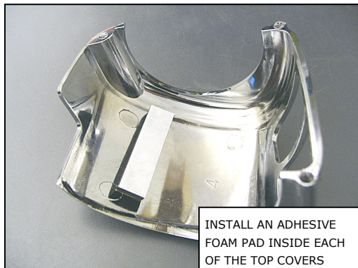
INSTALL AN ADHESIVE FOAM PAD INSIDE EACH OF THE TOP COVERS

Using the back of your fingernail, rub the brown adhesive backing on two foam pads to activate the catalyst, remove the backing and install the adhesive foam pads on the inside of the top covers as shown in PIC 1.