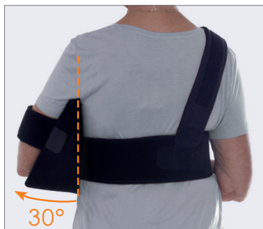
Abduction 30 degrees.