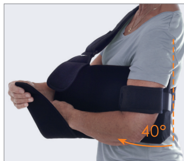
Elevation 40 degrees.