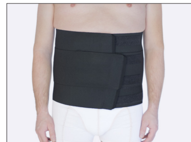
ViraKing - only in black, size 2-3XL.