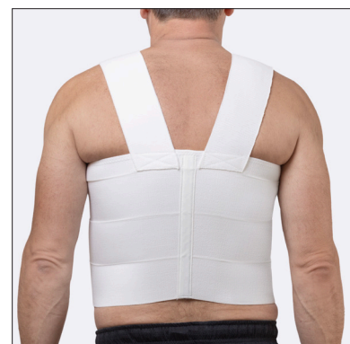
50301 - 30 cm height