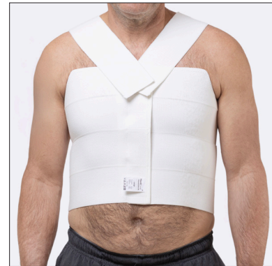
50301 - 30 cm height