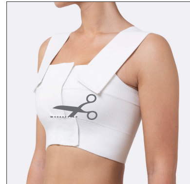
50300 - 23 cm height: To improve fit for a larger bust, cut between the seams.