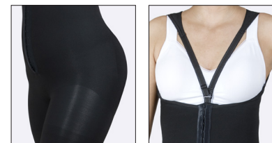
The shoulder straps can be attached at the front or in the sides.