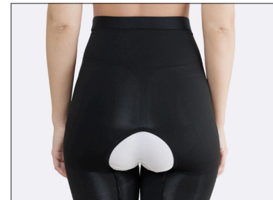
Hook and eye closure on both sides and silicone waistband.