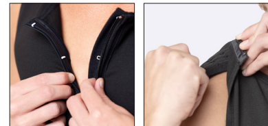
Adjustable shoulder straps. Zipper with hook-and-eye.