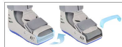
Removable and adjustable toe protection.