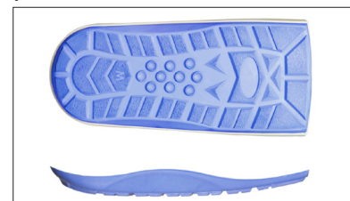
Low rocker sole for a natural gate.