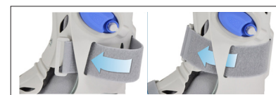
The circular bands can be slipped through the shell to allow for maximum compression.