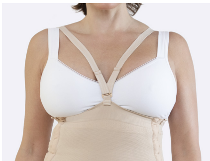
The adjustable shoulder straps can be attached in the middle front or sides.