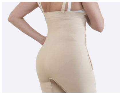
Shaped knitting to follow the body contour.