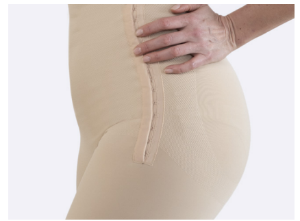
Extra support over the abdomen.