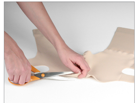
Can be trimmed around cheek, chin or neck for optimum comfort and fit.