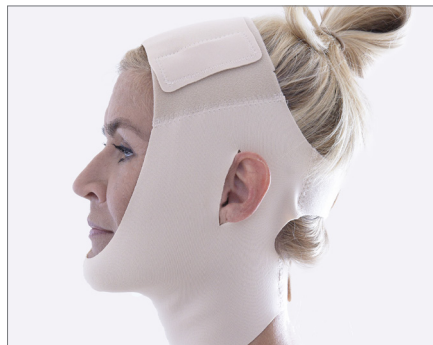
It is possible to cut openings, such as holes for the ears.