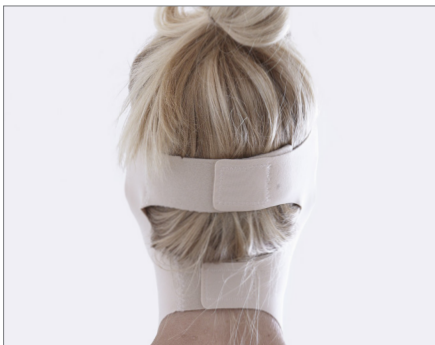
Adjustable velcro straps for best fit. The length of the straps can be shortened.