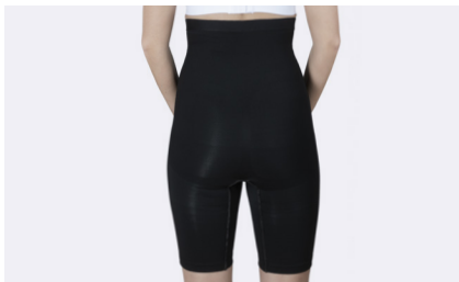
Comfortable fit with custom compression.