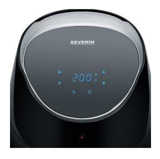
Big intuitive LED touch display for fast and simple operation.