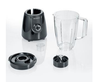
All parts can be disassembled and cleaned easily.