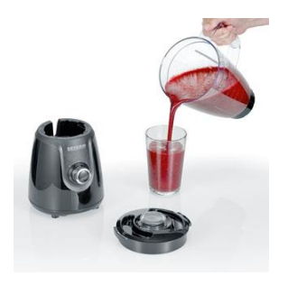
Detachable bowl, capacity approx 1.5 liter.