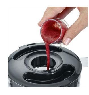
Lid with measuring cup and opening for easy addition of ingredients.