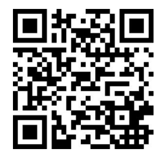
Tasty and healthy recipes available online at any time via QR-Code.