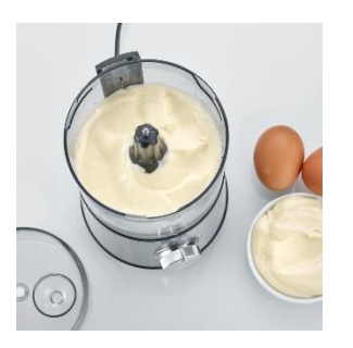
Innovative multi-whisking disk for making mayonnaise, whipped cream, egg white and much more.