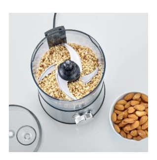
High-grade 4-blade stainless-steel knife on two levels for finest results.