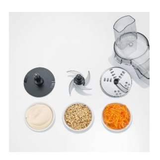
4-in-1 multi-functional chopper in space-saving stainless-steel design with practical food-processor attachment for cutting and grating - ideal for making salads, hash browns, roast potatoes and much more.