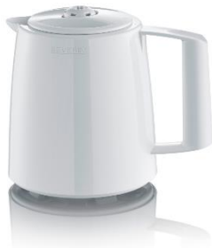
Thermo carafe with drip-through lid for long lasting heat retention.