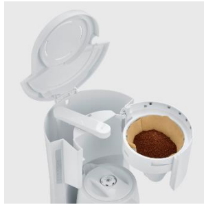
Removable swivel filter with detachable filter inlet for easy operation.