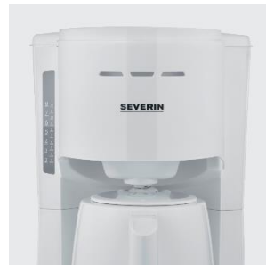
Water level indicator, frontal, good visibility.