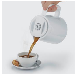
Easy pouring out, no dripping.