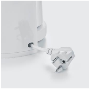
Integrated cable compartment for easy storage of the connection cable.