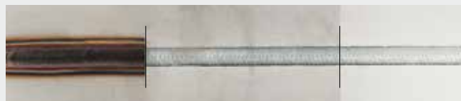
/ CrNi before cleaning / after cleaning / after burnishing