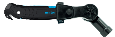
TELESCOPIC POLE NO. 9945