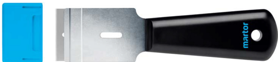
85% of original size

It really feels good, the large, rounded handle of the SCRAPEX ARGENTAX. But even the performance of this classic scraper convinces. So you can free all smooth surfaces from residue and remains with it - no matter whether at work or at home. When you're done, push the protective cap over the blade, and everything is safe.