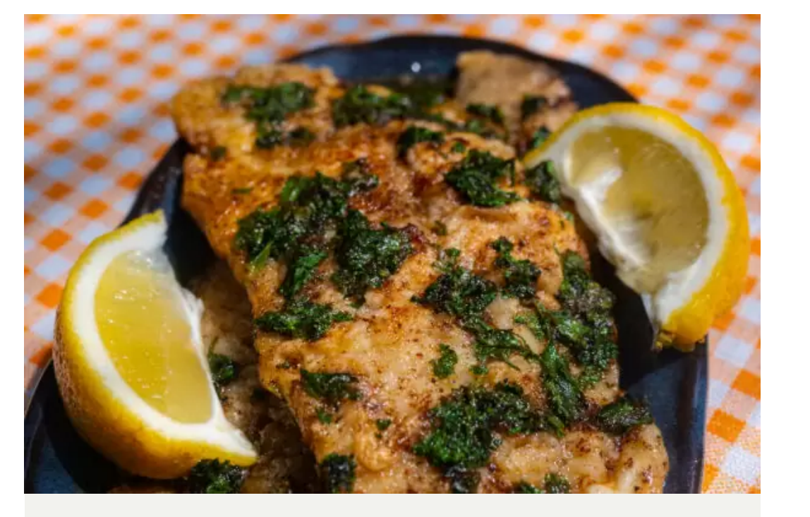
Sole Meuniere MEDITERRANEAN