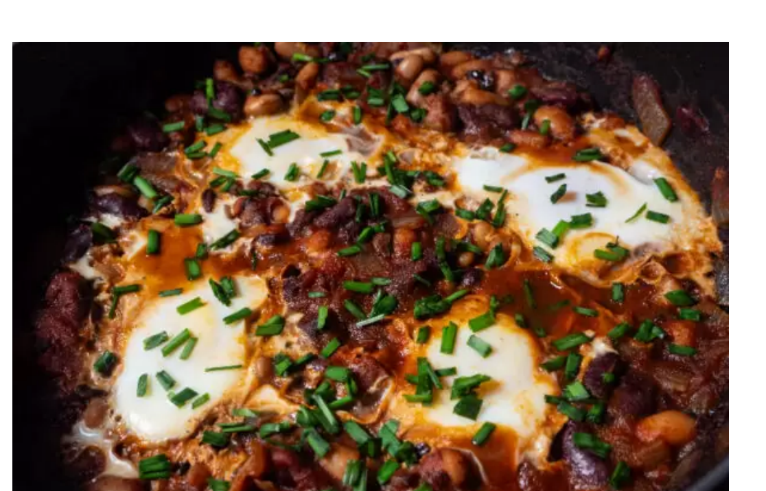
Chipotle Beans With Baked Eggs WORLDWIDE

Place the chicken thighs in the middle and garnish with the lemon slices and spring onion.