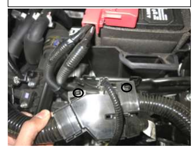
h. Pull on the (2) small tabs, circled above, then pull the engine harness from its mounting bracket.