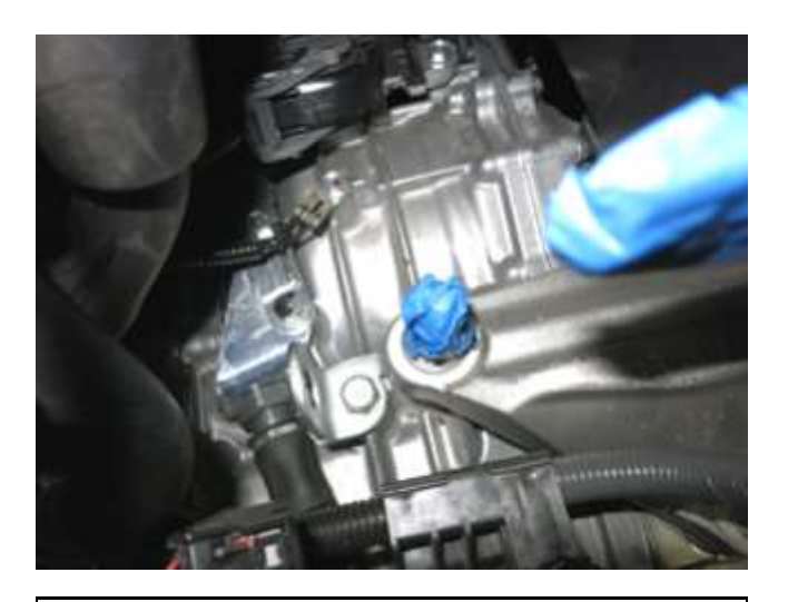
b. Also, wrap the end of the transmission mount stud.