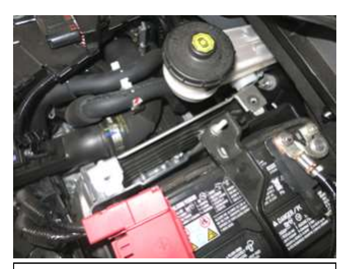
g. Use a 10mm socket to remove the (2) M6 bolts fastening the battery heat shield. Remove the heat shield. Do not discard these components.