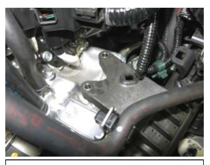
f. Use a 10mm socket to remove the (2) M6 bolts fastening the stock charge pipe to the engine block. Do not discard this hardware.