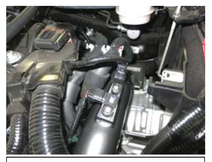
m. Reconnect the MAP and IAT sensor harnesses.