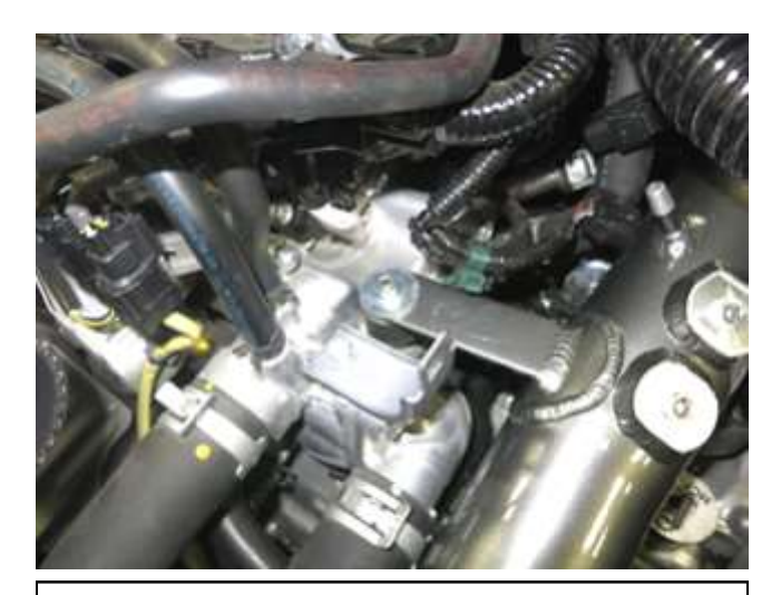
k. Adjust the charge pipe for best fitment. Once you are satisfied, fasten the mounting bracket to the rubber mount with the supplied washer and nut. Also, tighten the hose clamps at the throttle body coupler and intercooler hose to 30 in-lbs. You may also remove the tape applied in steps 3a and b at this time.