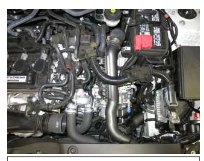
n. Begin removal of the charge pipe from the engine bay by rotating the pipe counter-clockwise. Refer to image above for the desired orientation.