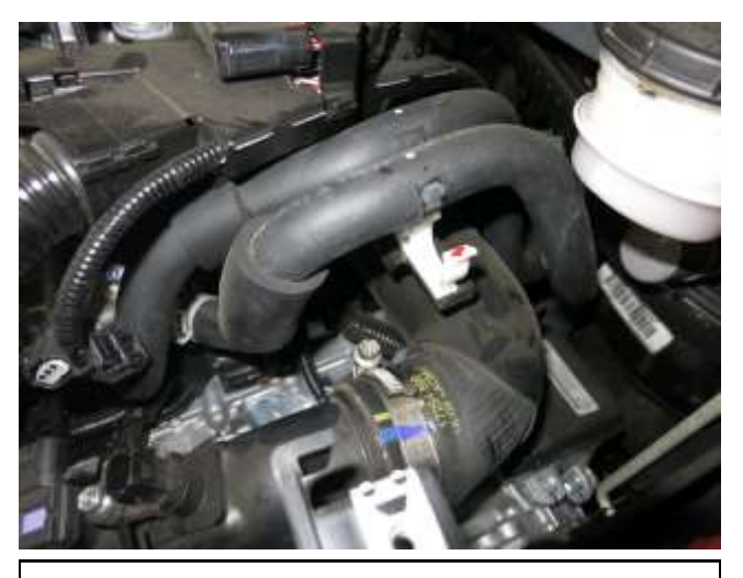
I. Lift the (2) heater hoses from their clips pull them aside.