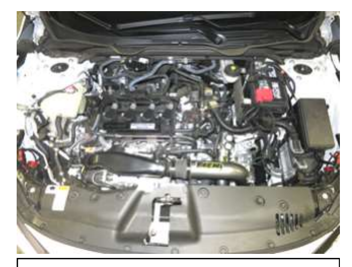
AEM CHARGE PIPE INSTALLED