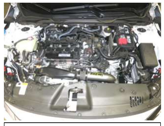
STOCK CHARGE PIPE INSTALLED