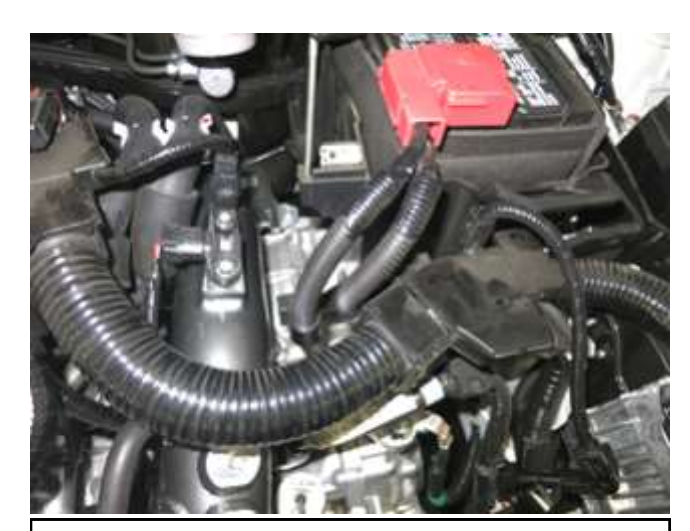
n. Reattach the (2) harnesses to the mounting bracket.