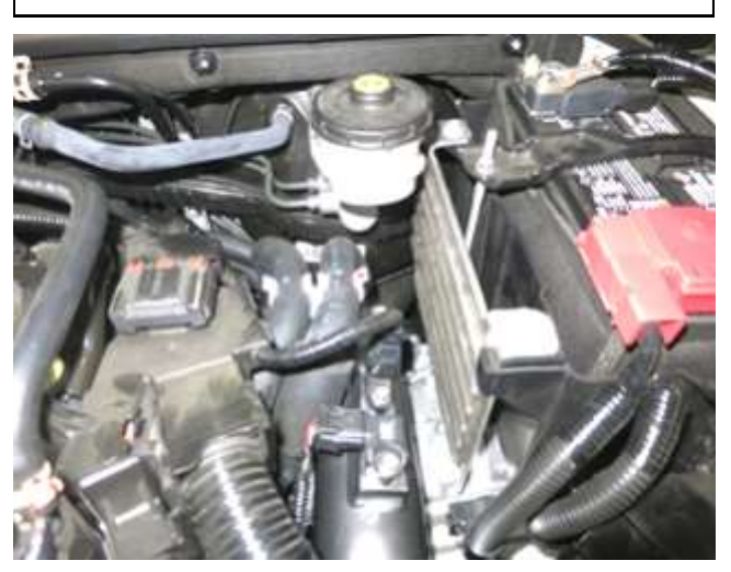
o. Reinstall the battery heatshield.