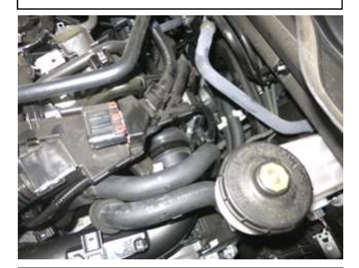
i. Once the charge pipe is in its proper location, insert the upper end into the throttle body coupler. Do not tighten the hose clamp yet. You may reattach the heater hoses into their clips at this time.