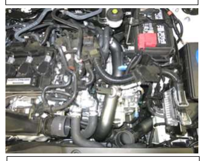
h. Rotate the pipe counter-clockwise as you push it towards the rear of the vehicle. Lower the bottom end of the pipe past the radiator shroud and radiator hose.