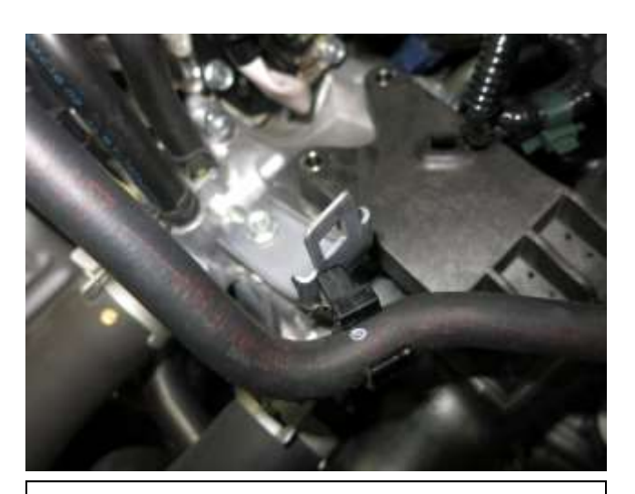
j. Pinch the tabs on the plastic clip holding the vacuum hose you disconnected in step 2d, then pull the clip from the mounting bracket. Move the hose aside.