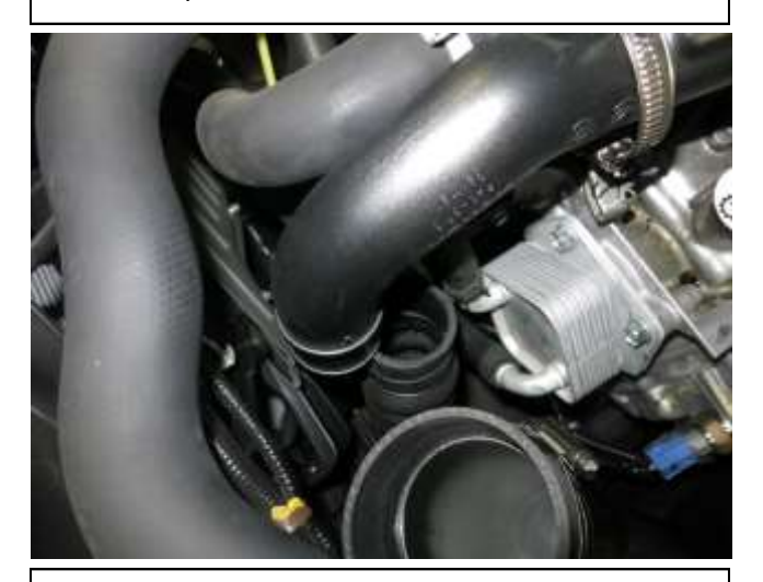
m. Loosen the hose clamp securing the charge pipe to the intercooler hose. Then, pull the charge pipe from the hose.