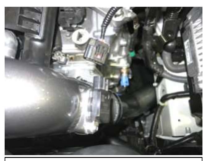
a. Disconnect mass air flow (MAF) sensor harness.