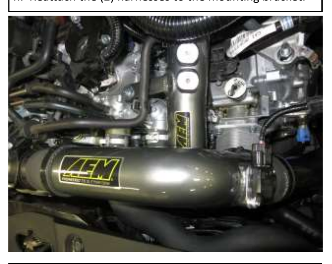
p. Reinstall the upper AEM intake tube. Make sure it does not contact the charge pipe. Finally, reconnect the MAF sensor harness.