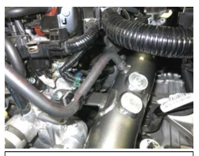
I. Install the vacuum hose to the nipple and secure with the factory spring clamp. Then, reattach the plastic clip to the mounting bracket.