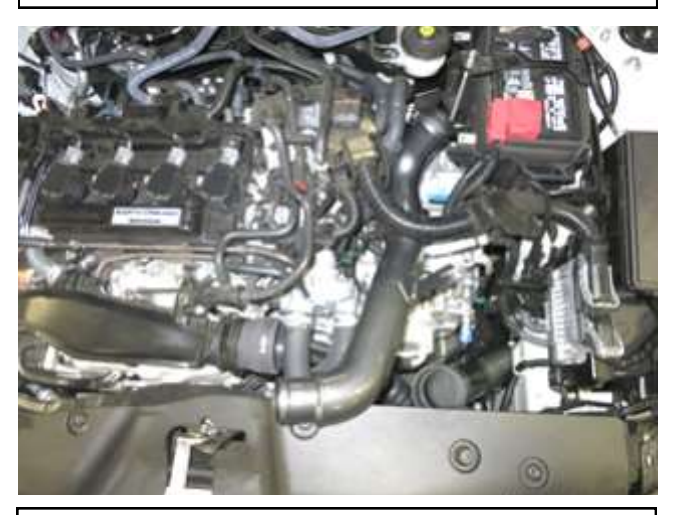
g. Insert the AEM charge pipe in the orientation shown above.