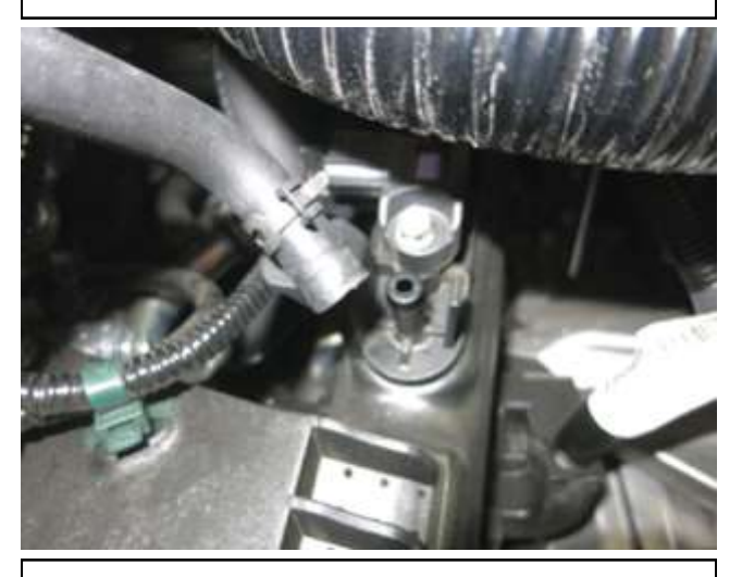
d. Use pliers to pinch the spring clamp and pull the vacuum hose from the stock charge pipe nipple.

b. Loosen the hose clamps securing the upper AEM intake tube; one on the turbo inlet pipe coupler and one on the upper and lower intake tube coupler. Then, pull off the upper intake tube.