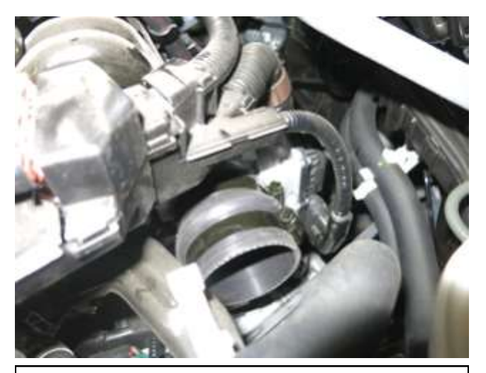
e. Install the hump hose coupler onto the throttle body, with the supplied hose clamps. Tighten the hose clamp on the throttle body side to 30 in-lbs.