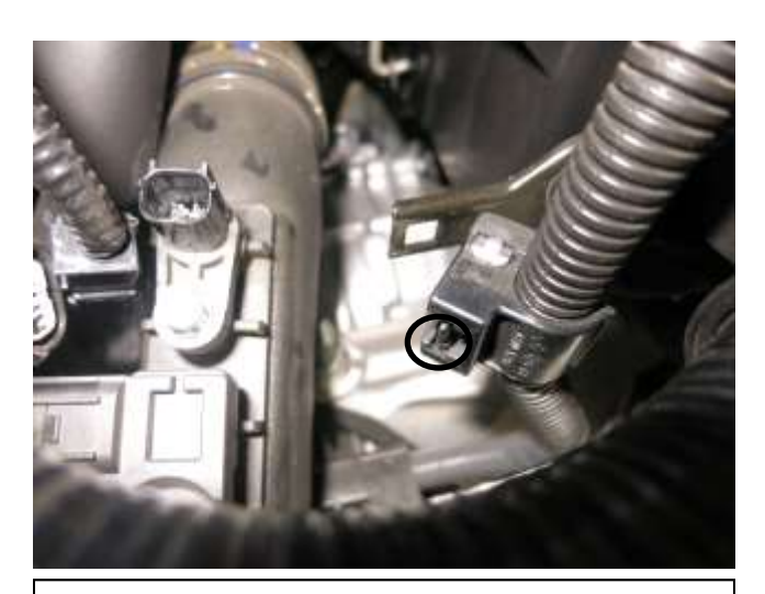
i. Pull on the small tab, circled above, then pull the harness from its mounting bracket.