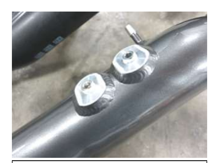
d. If you will not be installing AEM's water/methanol injection kit, thread the supplied 1/8" NPT plugs into the water/methanol injection bungs. Be sure to wrap the threads in Teflon tape beforehand to prevent any boost/vacuum leaks.