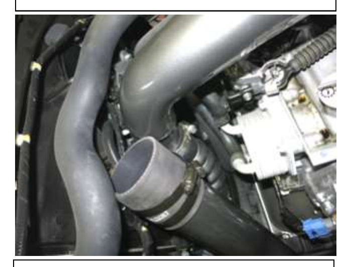
j. Insert the lower end of the pipe into the intercooler hose. It may help to spray the end of the pipe with soapy water. Alternatively, you can heat the hose end with a heat gun or blow dryer. Do not tighten the hose clamp yet.