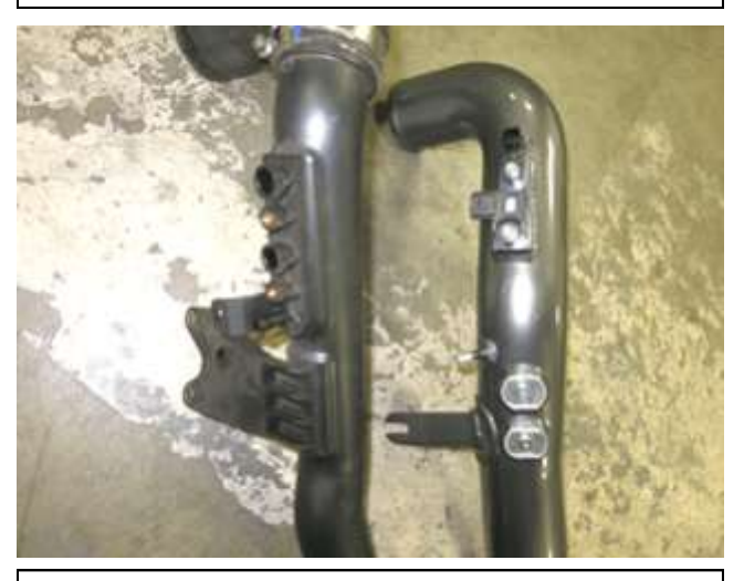
c. Using the stock hardware and an 8mm socket, transfer the MAP and IAT sensors from the stock charge pipe to the AEM charge pipe.