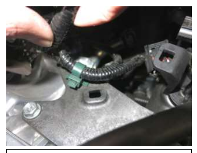
e. Use a small flat head to pry the harness mount from the stock charge pipe mounting bracket.