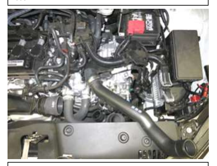
o. Lift the bottom end of the charge pipe over the radiator shroud as you continue to rotate (counter-clockwise) and pull the pipe towards the front of the vehicle. Do not discard the stock charge pipe once it's removed.