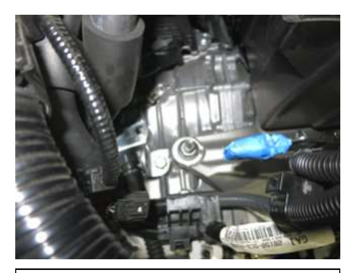
a. Before commencing the install of your AEM charge pipe, wrap the end of the bracket, shown above, in tape. This will protect the pipe from scratches as you maneuver it into place.

a. When installing the performance system, do not completely tighten the hose clamps or mounting hardware until instructed to do so.