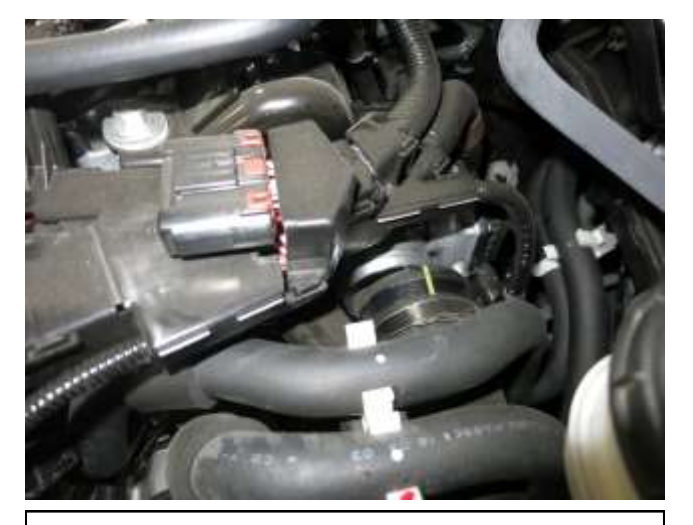
k. Loosen the hose clamp securing the charge pipe to the throttle body. Then, pull the hose end off of the throttle body.