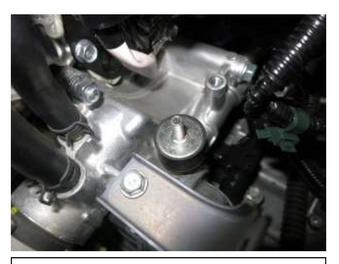
f. Install the rubber mount in the location shown above.