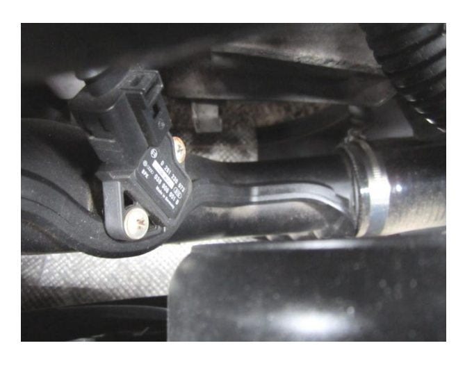
1.4 TSI On top of inlet manifold