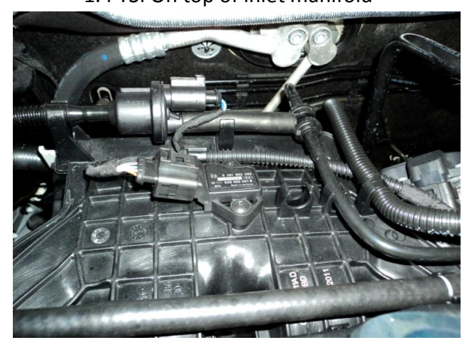
Remove the two T25 Torx head screws (Allen head bolts TTRS) and remove the map sensor