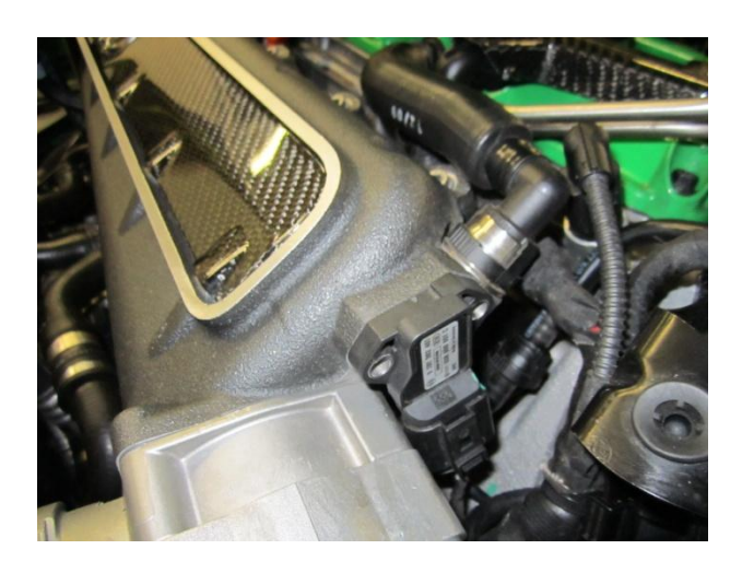
1.2 TSI On top of inlet manifold

Please see below the location of where the boost gauge take off will be installed. 2.5 TTRS/RS3 Side of inlet manifold VAG 1.8T / 2.0T Throttle body plastic pipe