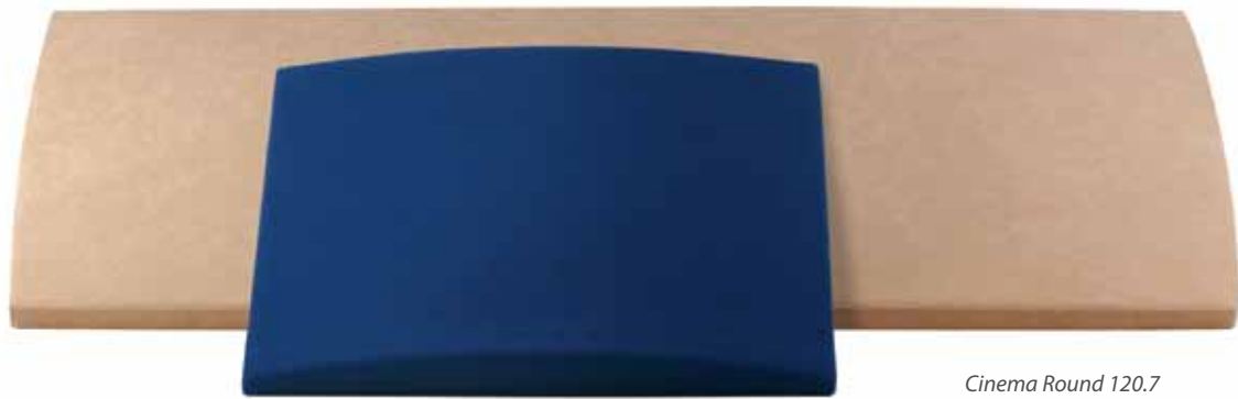
Cinema Round 120.7

Combining modern design with maximum acoustic efficiency, the fabric-covered Cinema Round Premium panel is commonly used to control sound reflections and excess reverberation. It helps you maximize the performance of your listening space. Cinema Round Premium performs mainly on low midrange to high frequencies. It has been proved to be one of the most stable panels with a very high and linear absorption coefficient. Cinema Round Premium is available in two different sizes and fifteen fabric colours.