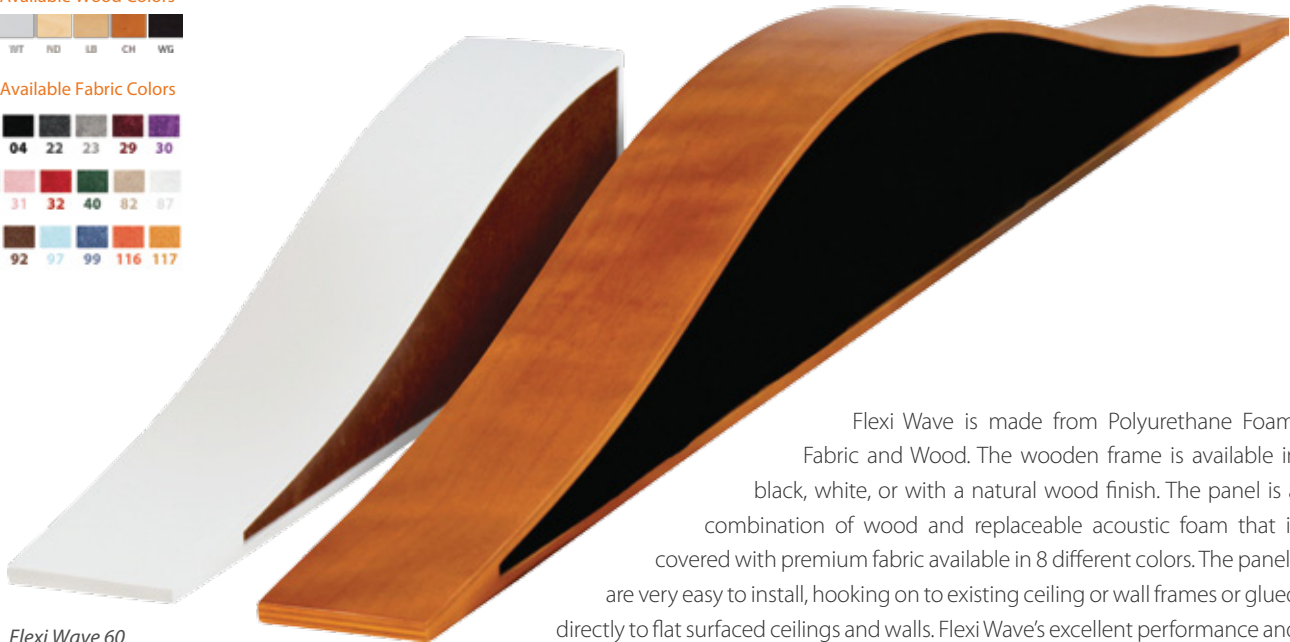
Flexi Wave 60