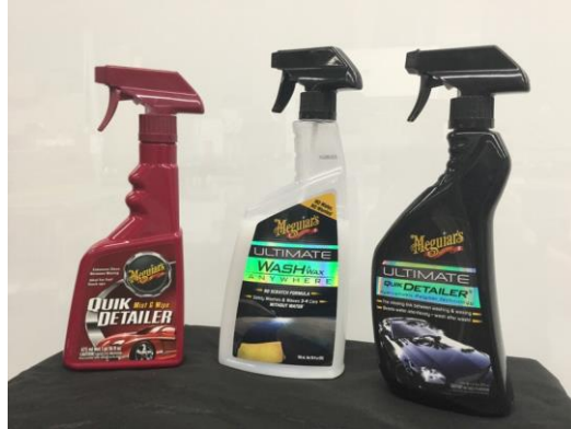
Figure 2: Recommended Meguiar's® Finishing Products

Meguiar's® offers a variety of finishing products such as those shown in Figure 2. Before using any of these products and procedures, test and approve them in an inconspicuous area of film prior to using them on the entire wrap.